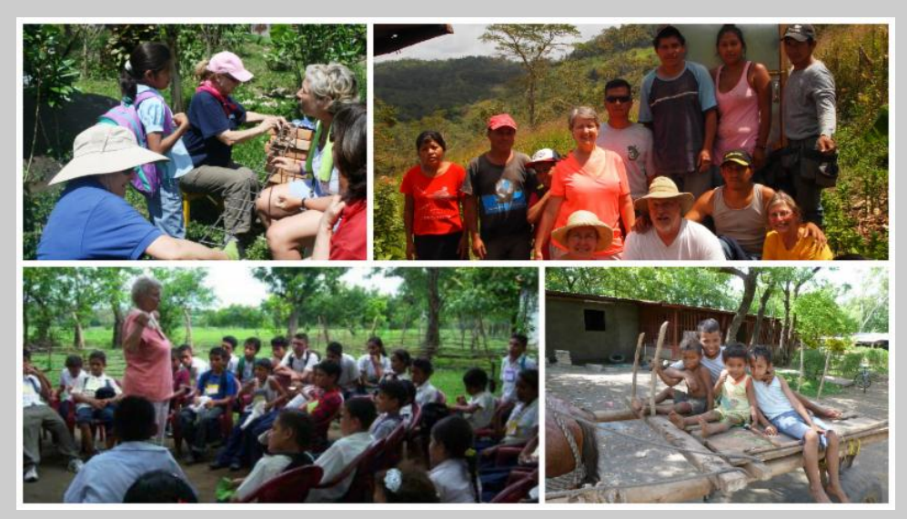
Partners at work

I remember the first time I visited Chacraseca in 1998 - the summer before Hurricane Mitch hit. It was a very different community than it is today. The only buildings in the central area were the church and a little storage room where our groups rolled out our sleeping bags at night. And after Hurricane Mitch hit Chacraseca in October of '98, things got even worse - roads were impassable, schools were unusable, crops were destroyed, and hundreds of the 5,000-6,000 residents of Chacraseca were left to construct small lean-to houses, made of plastic tarps.